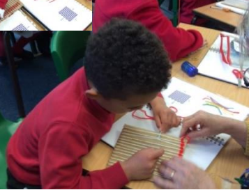
Year 3 have been engrossed in their weaving project.